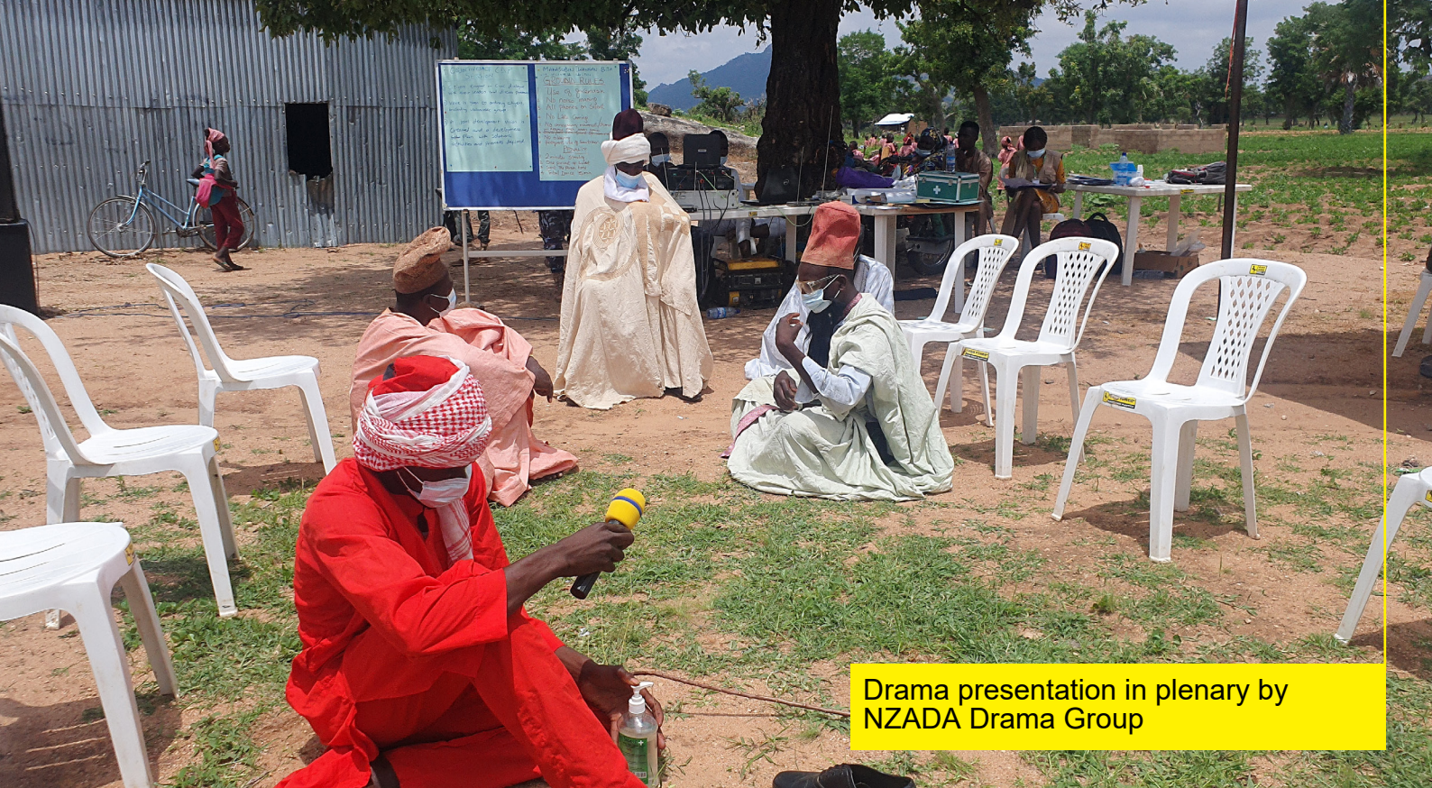
Drama presentation in plenary by NZADA Drama Group

This publication has been produced with the financial support of the European Union and the German Federal Ministry for Economic Cooperation and Development (BMZ). The contents of this publication are the sole responsibility of the GIZ and do not necessarily reflect the views of the European Union or the BMZ.