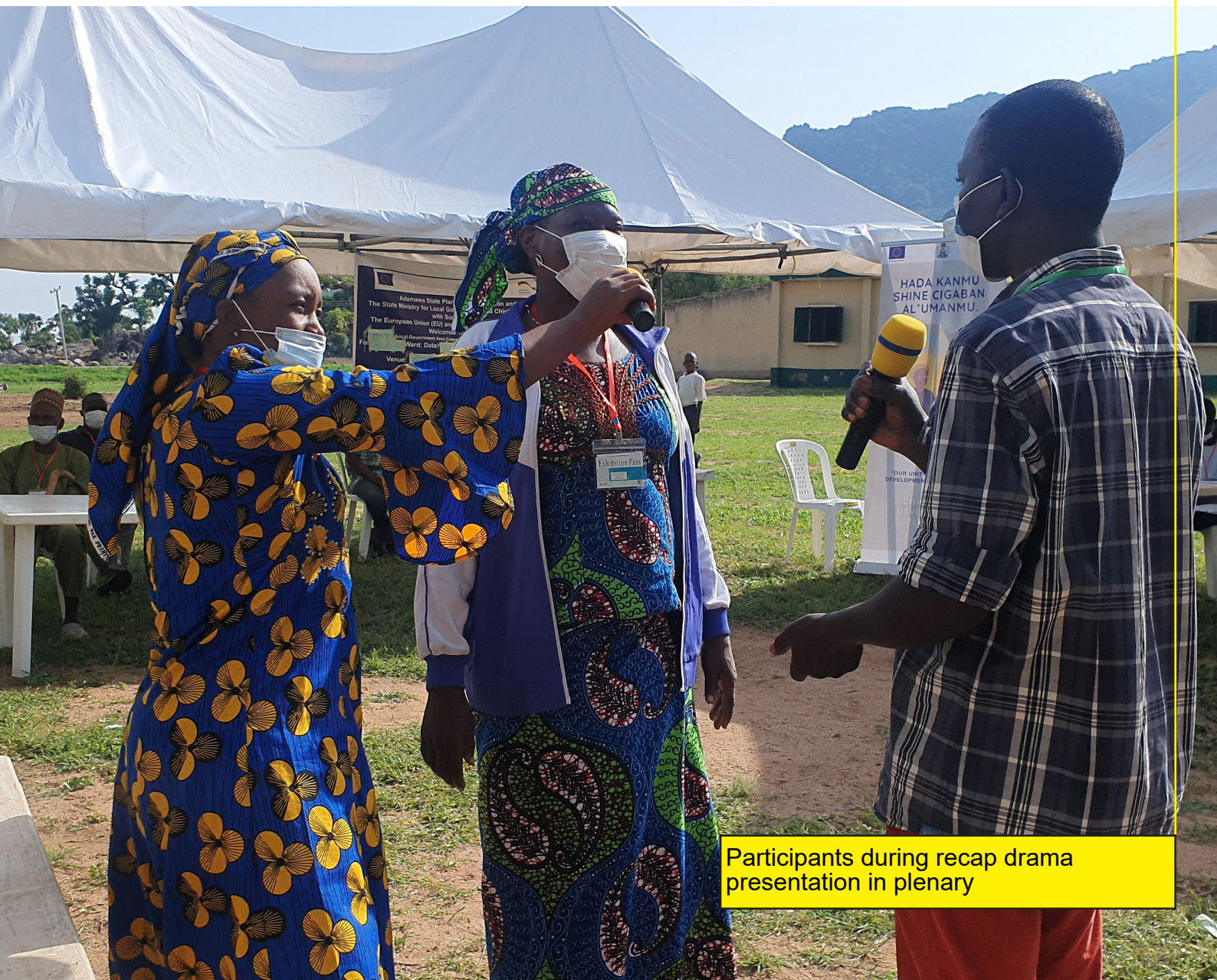
Participants during recap drama presentation in plenary