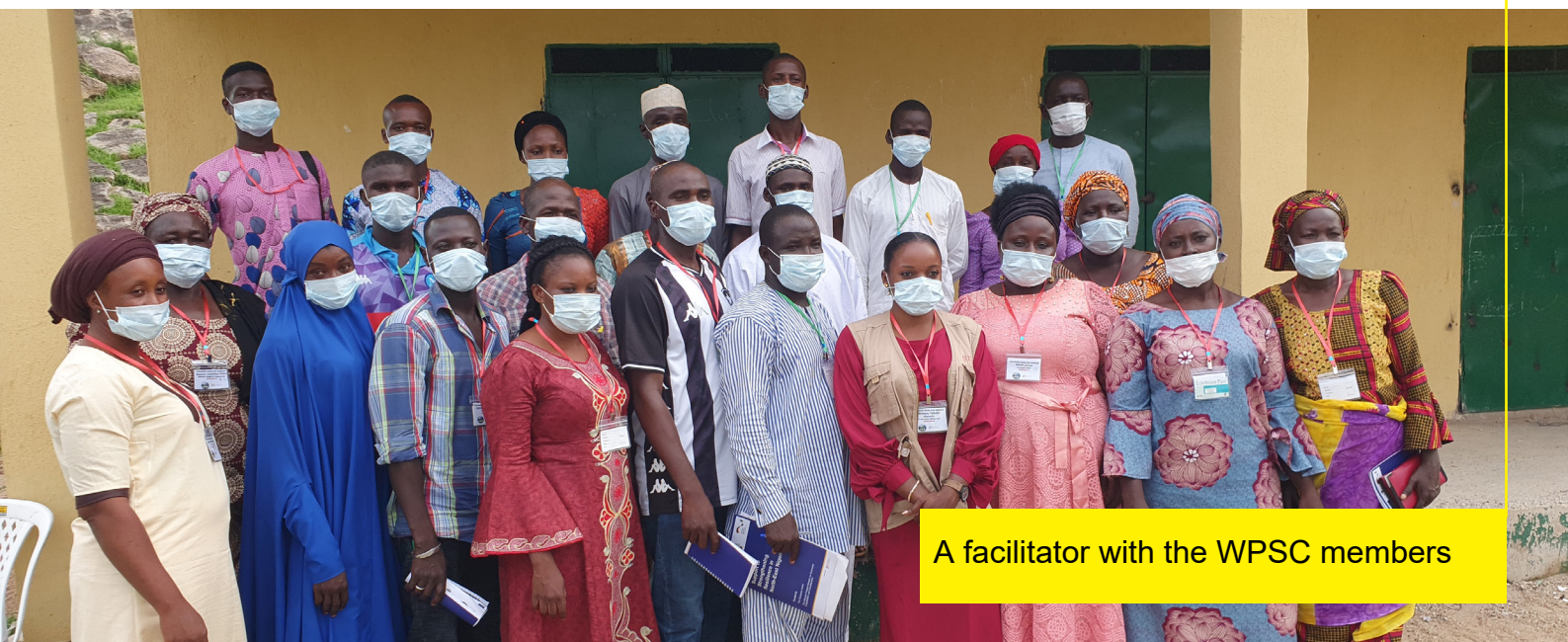
A facilitator with the WPSC members