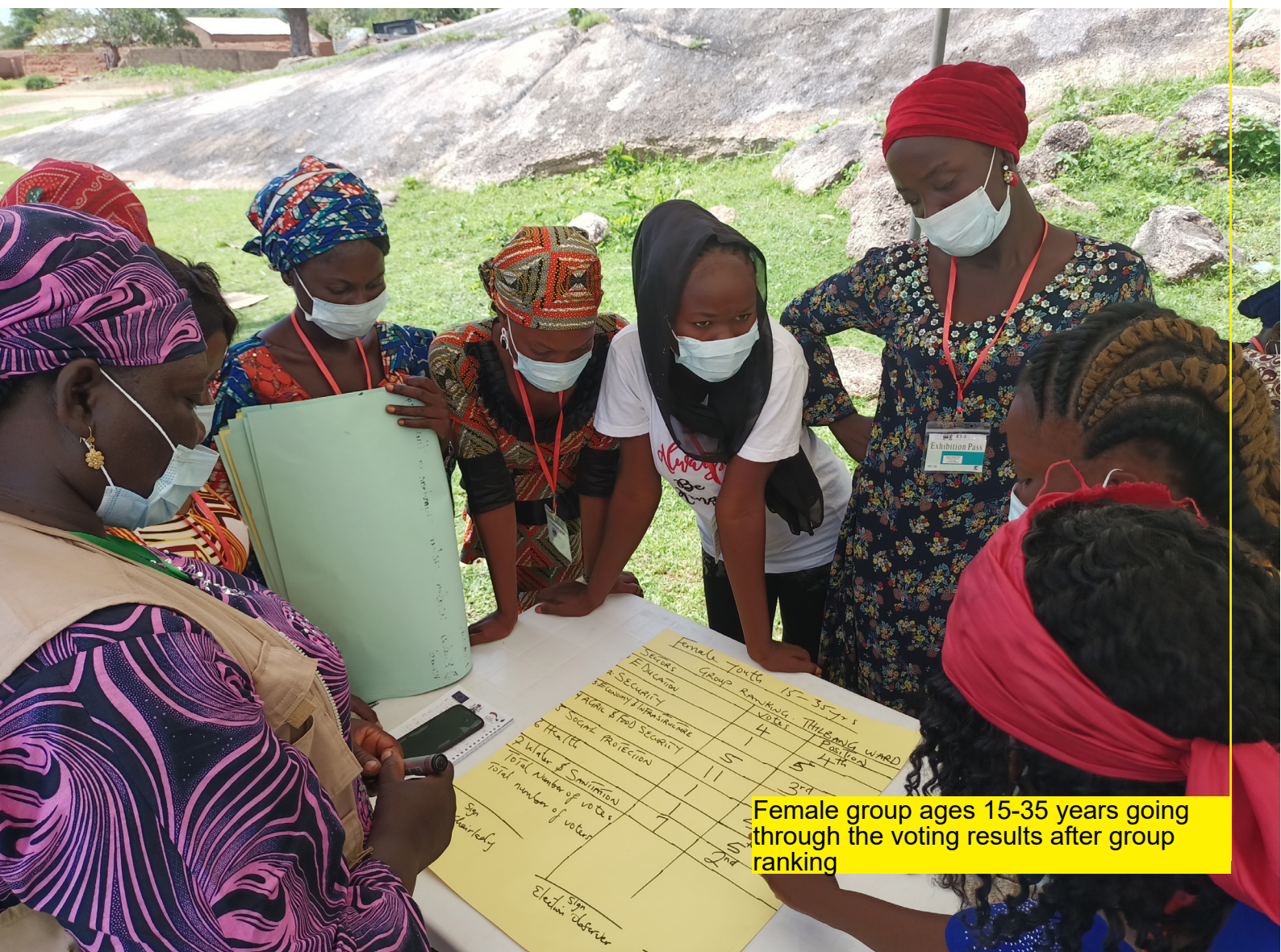
Female group ages 15-35 years going through the voting results after group ranking