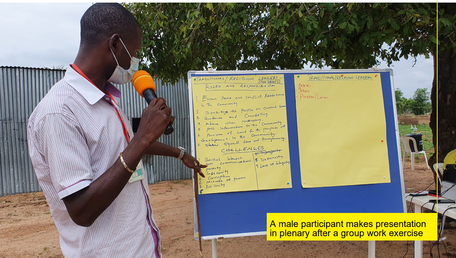
A male participant makes presentation in plenary after a group work exercise

election, high rate of kidnapping, high rate of typhoid and malaria and lack of agricultural extension workers. We determined that the aforementioned challenges have truncated our development, livelihoods, and security adversely. Furthermore, we collectively voted and determined our top three priorities, which are Agriculture and food security, health and Education respectively. To follow up on our future community development, we selected 25 persons among ourselves as the Ward Project Supervisory Committee (WPSC), for project supervision, lobbying and follow-up.