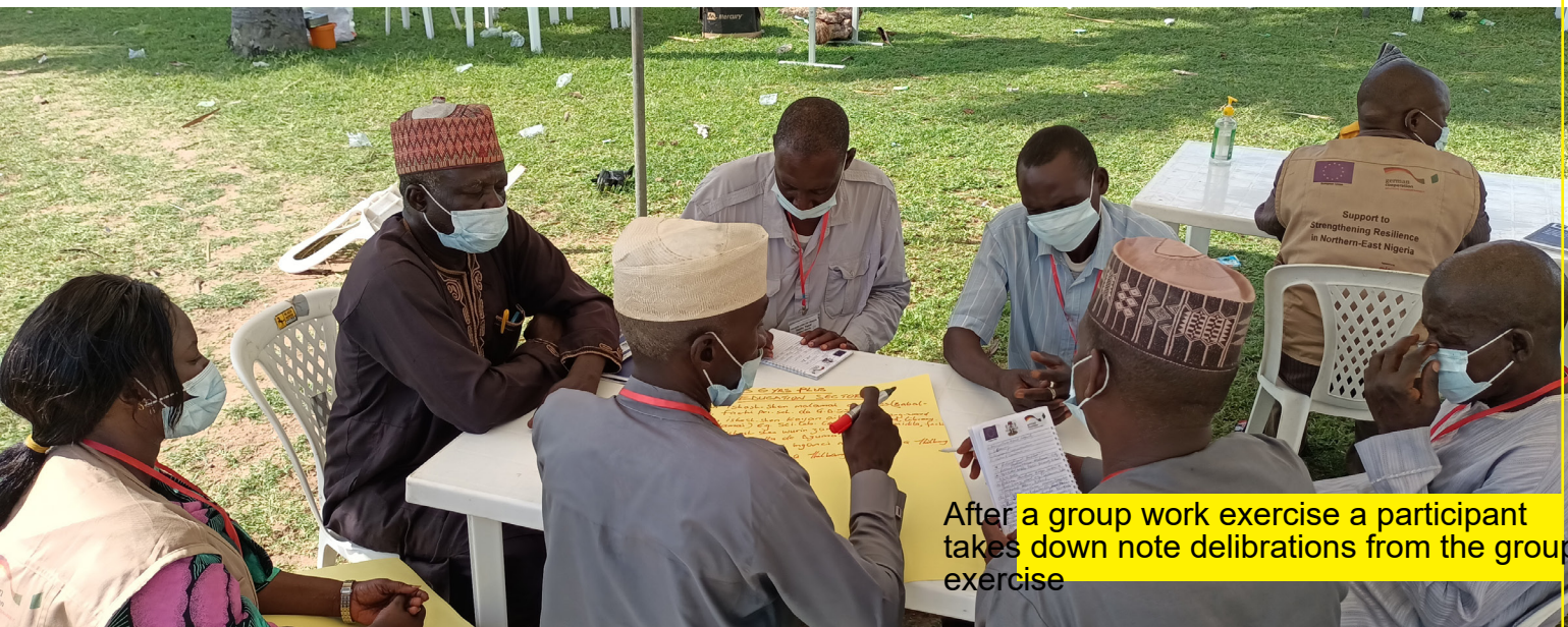
After a group work exercise a participant takes down note deliberations from the group exercise