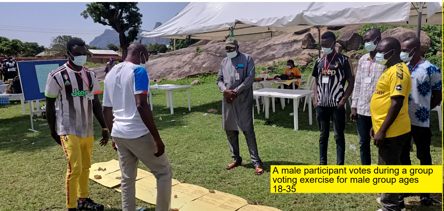
A male participant votes during a group voting exercise for male group ages 18-35