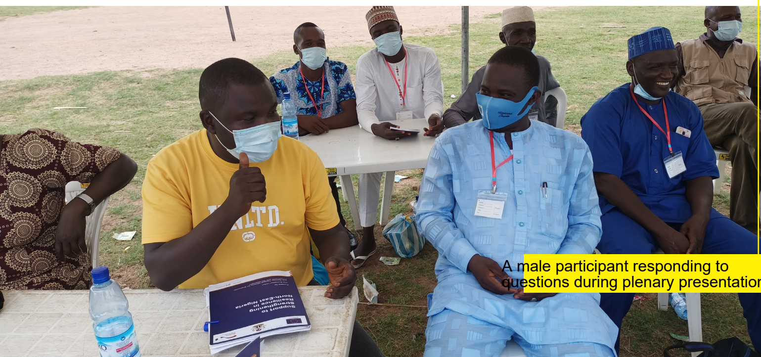
A male participant responding to questions during plenary presentation